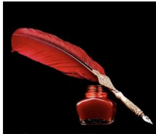
NOCTES AMBROSIANÆ, VOLUME 3